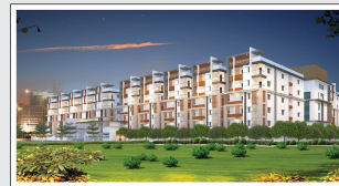
LAXMI URBANIA @ OPP. TO TCS, ADIBATLA