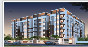
AADHYA'S BRUNDAVAN @ TURKAYAMJAL